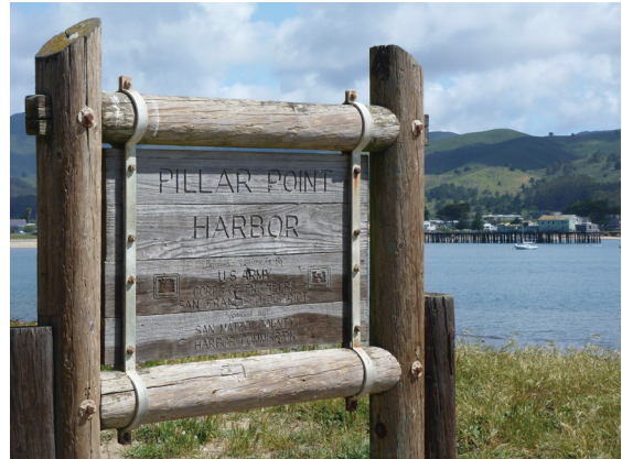
Pillar Point Harbor Sign