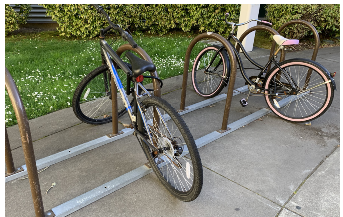
Example of Bike Parking